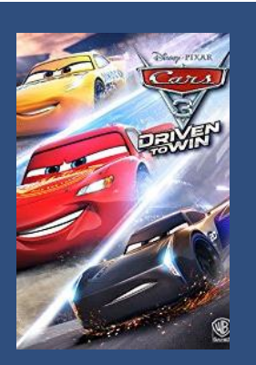
DEC 9 • 2:00 PM CENTENNIAL • $3