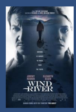
DEC 5 • 2:00 PM CRYSTAL RIDGE $3